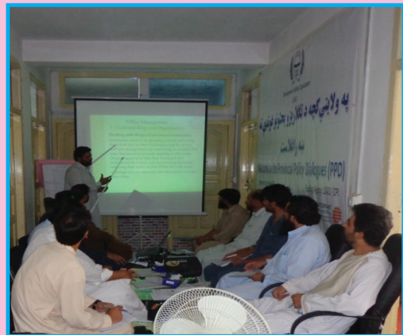
From May to July, 2013 I-PACS and PRC activities